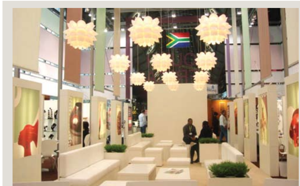
Western Cape craft producers exhibit on the dti's stand at Ambiente.

The CCDI also helped 27 producers to cut through red tape and to register for export licences .