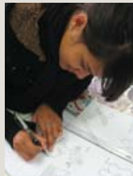
Deep concentration during a drawing and design module.