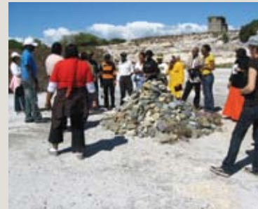
Sense of place visits to Kirstenbosch and Robben Island, and creativity workshops.

New products and new designs are emerging all over the province – inspired by the Creativity, Design and Innovation programme that's helping craft producers to explore new materials, techniques and technologies.