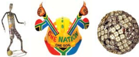
Recycled soccer player by Mixed Ideaz; a Mokoya Makaraba; and a soccer ball of bottle tops by Mixed Ideaz.

The GIFT Warehouse is not only helping Western Cape-based enterprises to source the perfect gift , but has expanded its offering to include a 2010 range in the run-up to the World Cup™.